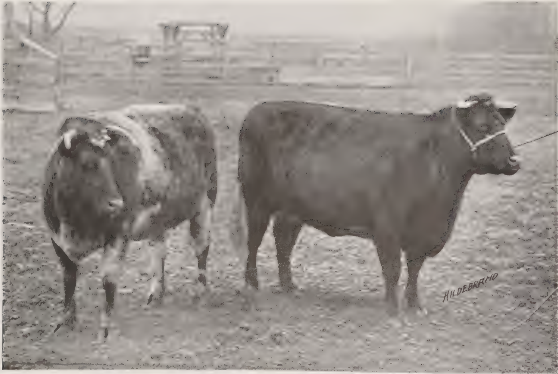
LOVELY OF PARKDALE—LOVELY OF PARKDALE 3D.